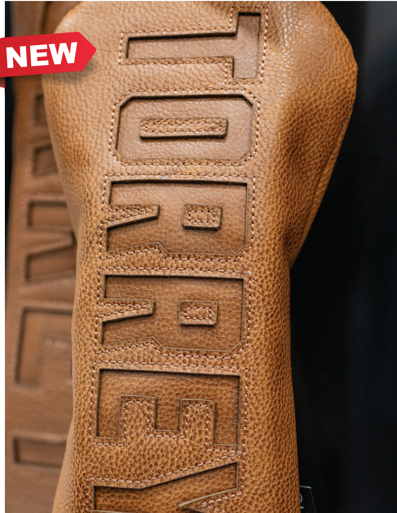
CUT OUT LETTERING